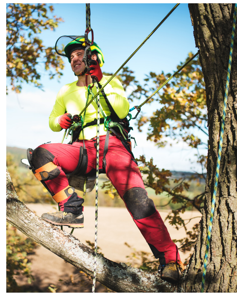
Arborists and other tree workers are of immense importance to protecting birdlife. Training is available to provide the awareness and techniques necessary to do tree work while at the same time preventing damage to vital habitat or impacting the life cycle of birds.

When planting or rendering advice, consider trees that are site appropriate, climate-appropriate, and friendly to birds and other wildlife.