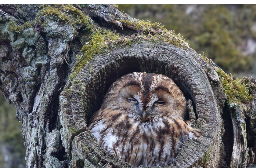
Sometimes a limb in a topped tree can be a benefit. This tawny owl, a native of Europe and Asia, would agree.