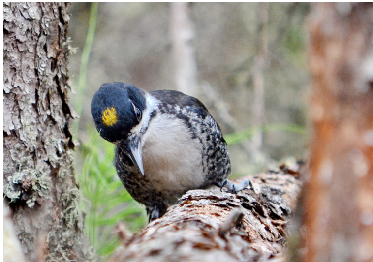
Cavity nesters like this black-backed woodpecker are dependent on dead or decaying trees for protection and breeding. All species of woodpeckers and many others need these trees as they feed on insects.