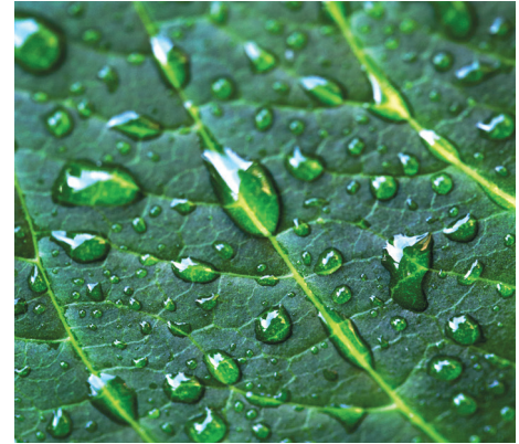
Depending on species and time of year, water retained on leaves can be significant.

Evapotranspiration is at the heart of the rain-making concept. The “evapo” part comes from rainwater evaporating from surfaces, including leaves, and returning moisture to the atmosphere. The rest of the word is from the phenomenon by which water is drawn from the soil by roots, raised to leaves, and released into the air. Scientists believe that up to 40% of precipitation is due to evapotranspiration from forests; that number can be even higher in summer. Urban trees contribute to that life-giving water cycle right along with their rural cousins.