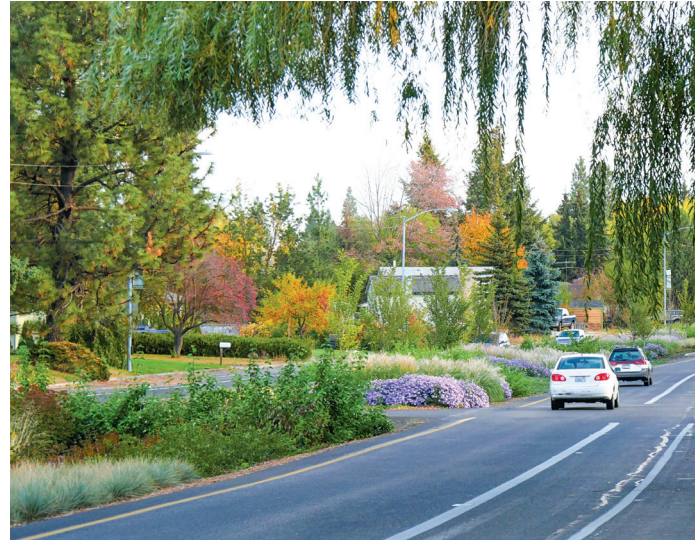
A streetside swale can be attractive as well as useful in retaining and cleaning stormwater runoff.

While some communities require swales in new developments, the vegetated aspect is sometimes overlooked. Designing with plant materials appropriate to the climate and site is important, as is a plan for occasional maintenance, but the effort is most worthwhile. Not only can trees and other vegetation provide the benefits described throughout this bulletin, they add to the beauty of the area, help calm traffic, and offer the welcome cooling effect of shade in the summer. A swale with only rock or sod is depriving the neighborhood of a full return on its investment.