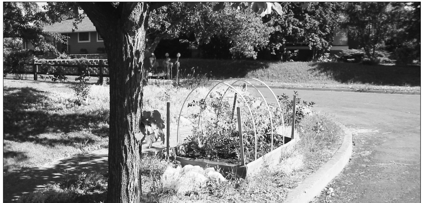
An innovative homeowner takes advantage of a spacious tree lawn to plant garden crops in a raised bed. The city's ordinances provide no restrictions on this use of the right-of-way.

Actions in support of permaculture may help your community qualify for a Tree City USA Growth Award.