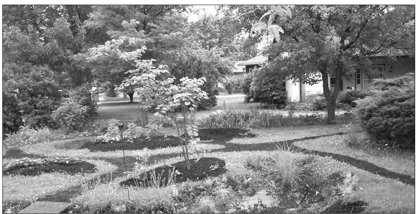
Beauty combined with utility have transformed this Illinois front yard into a model that inspired neighbors to follow suit. In 2006, its owners began with a water-retaining rain garden, flowers and five edible plants. Wanting to see how much food they could produce, these permaculture pioneers now have more than 40 edible plants growing in this space.

While most issues of Tree City USA Bulletin try to communicate and encourage best practices that are being used in urban and community forestry, this edition attempts to catch a wave of the future. It reflects a movement that some call the Urban Farm Movement, or an attempt to grow fruit and other food literally in one's backyard. A goal is not only to provide an affordable and available source of healthful food, but also to grow it in harmony with nature.