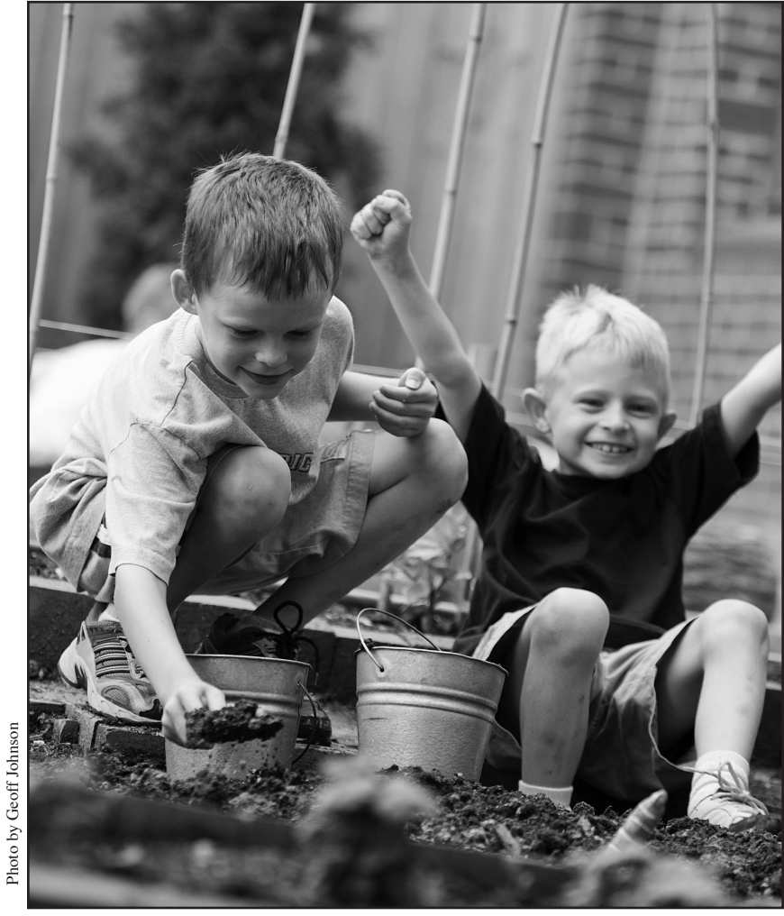
If we want children to flourish, to become truly empowered, then let us allow them to love the earth before we ask them to save it.

Urban foresters, volunteers and tree boards have a long tradition of meeting new challenges and adapting to the changing needs of their communities. Today one of the greatest needs is to re-connect children with nature. This bulletin is designed to show a way to do this that is research-based and field-tested. It is a way to help assure the stewardship of our community trees and other natural resources for generations to come.