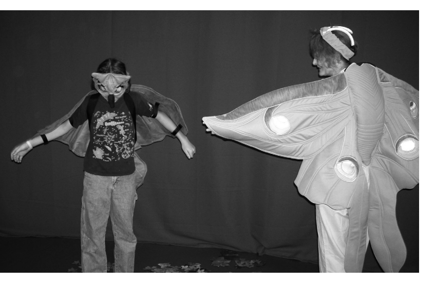
ArborDayprograms are not the onlyway to interest school children in the promise and plight of trees. The use of CHARACTERS, PUPPETS, PLAYS, and other dramatization is effective with both children and adults.