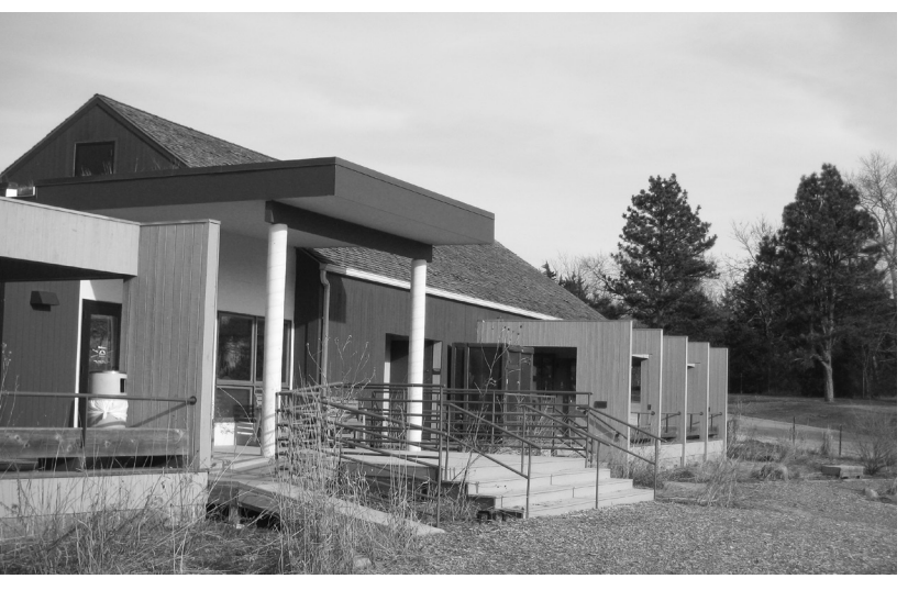
INTERPRETIVECENTERS of all sizes, shapes and levels of sophistication can enrich a community and promote a better understanding of urbanecology.

Ways to interpret trees are limited only by the imagination. In addition to trails and signs, here are some ideas that have worked well. Would some of these be helpful in your community forestry program?