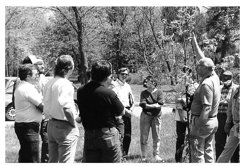
GUIDEDWALKS AND ACTIVITIES are powerful tools for interpreting trees. This is because you can adjust your presentation to the level of an audience's knowledge. Also, questions may be answered promptly and the audience can be actively involved — one of the surest ways to etch important information in memory.