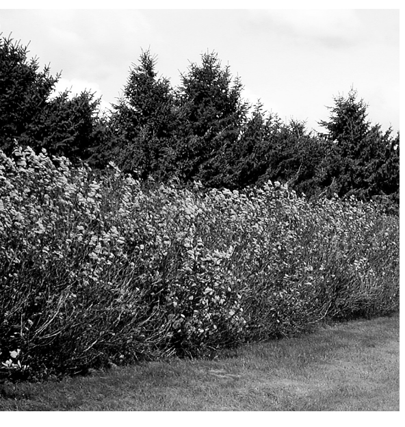
DEMONSTRATIONSITES are especially effective because they are visual proof of the possible. Windbreaks, attractive trees that are compatible with utilities, wild life plantings and Xeriscapes are among the demonstration sites currently being used.