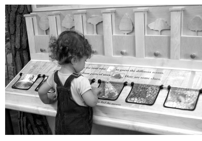
EXHIBITS offerane ffective way to combine sound, illustrations, real objects and narrative information. Although many are permanently housed in an interpretive center, don't overlook opport unities for portable displays for schools, banks, public buildings, fairs and meetings.