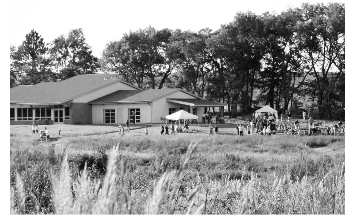
Communityinterpretivecenters,likethisoneoutsideofDenton,Nebraska,canmakeanimportantdifference for the future.

Then one Saturday morning the boy was sent to a program at what was then the Wissahickon Nature Museum. There, surrounded by the quiet woods of Riverview Park, he was introduced to the world of trees. In the course of a year, he looked at dormant buds under a hand lens, dug through the debris of leaves and twigs on the