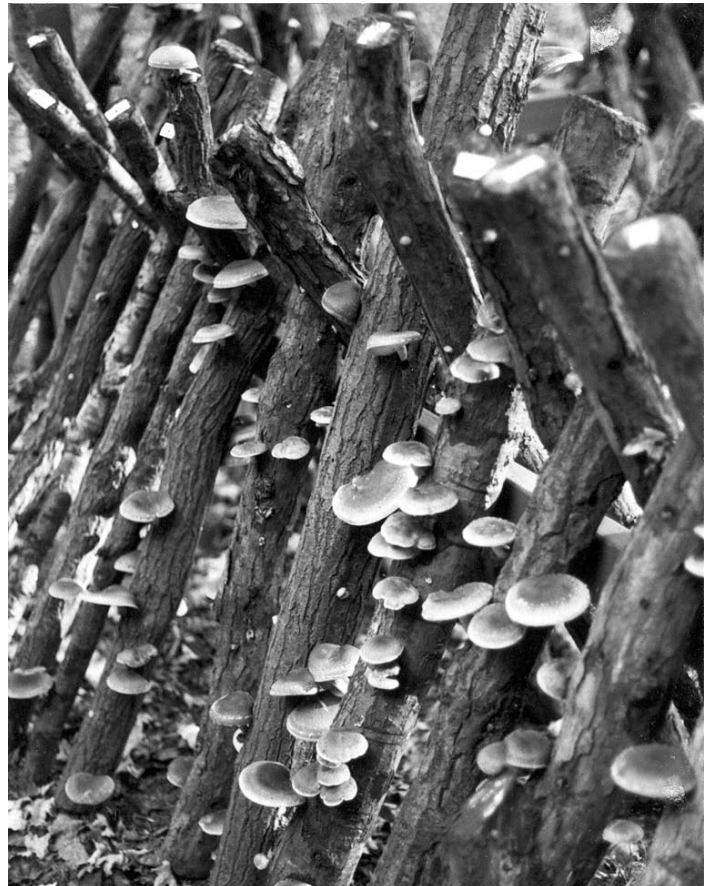
As soon as 6 months after logs are inoculated, shiitake mushrooms may be ready for harvest.

(black and yellow) matsutake, and boletus. Cultivated mushrooms include shiitake, chanterelle, oyster, and enoki.