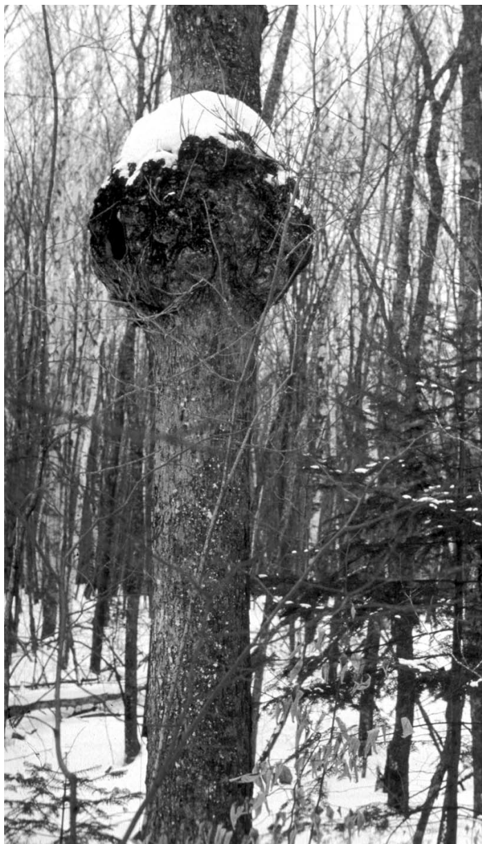
A burl has unique wood grain patterns valued by woodcrafters.

Burls are one of the best sources of beautiful wood grain. A burl is produced where an injury or other external stimulus has affected the growth pattern of the tree, causing a deformity. The resulting wood grain patterns may be wavy, swirled, marbled, or feathered. Woodcrafters value all of these characteristics.