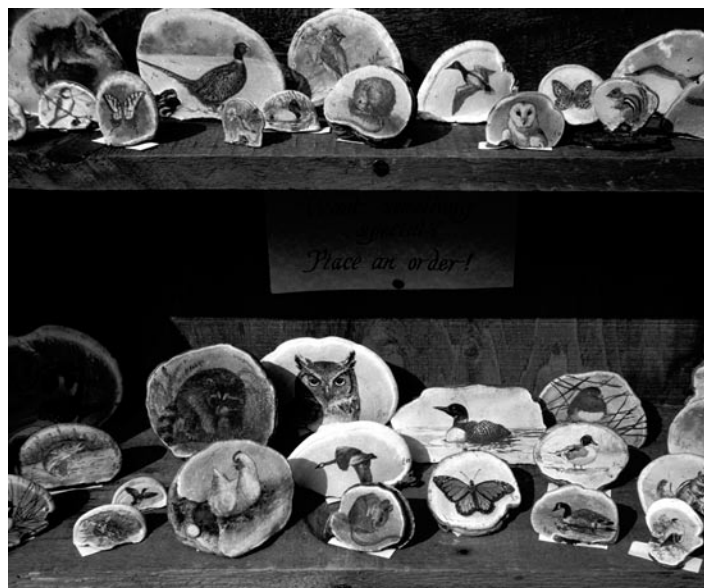
In the right hands these "artist conks" are transformed.