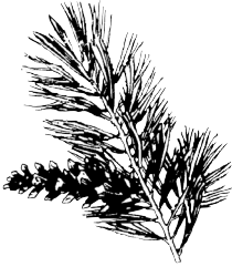
White Pine ( Pinus strobus ) No Paint