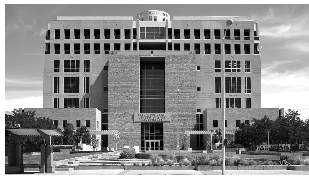
The Pete V. Domenici U.S. Courthouse Sustainable Landscape Renovation used sustainable strategies and practices to repurpose a former 4.4-acre greyfield in downtown Albuquerque, New Mexico.

The Sustainable Sites Initiative™ (SITES®) is an interdisciplinary effort by the American Society of Landscape Architects, the Lady Bird Johnson Wildflower Center at The University of Texas at Austin, and the United States Botanic Garden to create voluntary national guidelines and performance benchmarks for sustainable land design and construction and maintenance practices. A goal of this program is to enhance physical, mental, and social well-being as a result of interaction with nature. Although much of the focus is on site selection and a project's physical characteristics, there is an entire section devoted to Human Health and Well-Being. This section contains a significant part of the prerequisites for being designated a Sustainable Site.