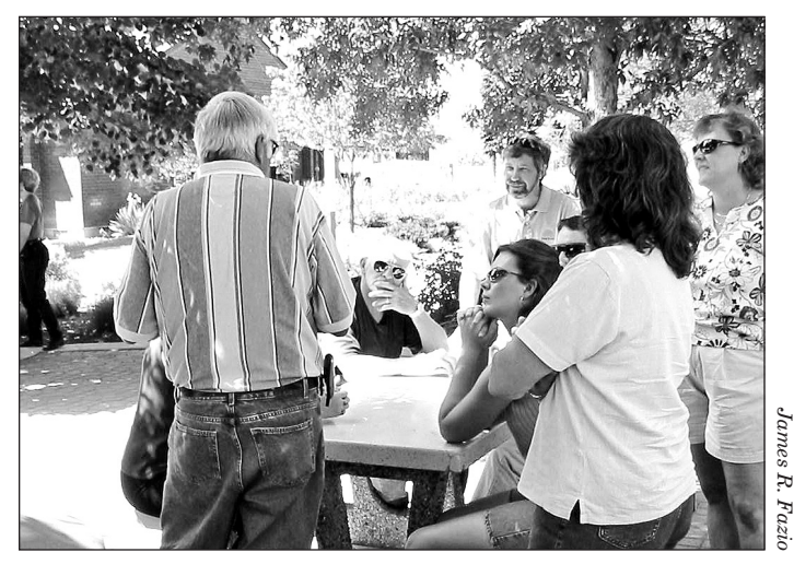
Whether indoors at a regular meeting or outside at a special meeting, inviting a local expert to share his or her knowledge and perspectives is a good way to increase the effectiveness of a tree board.

For more information about sources that can help grow a great tree board, please visit arborday.org/bulletins and click on Bulletin No. 54.