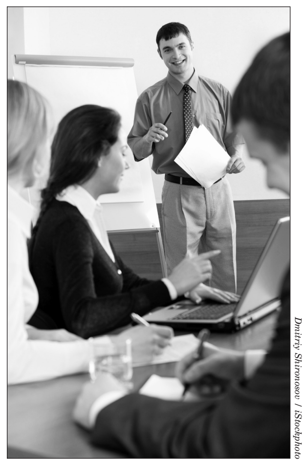
Good leadership is reflected in conducting meetings in a way that tree board members will want to attend.