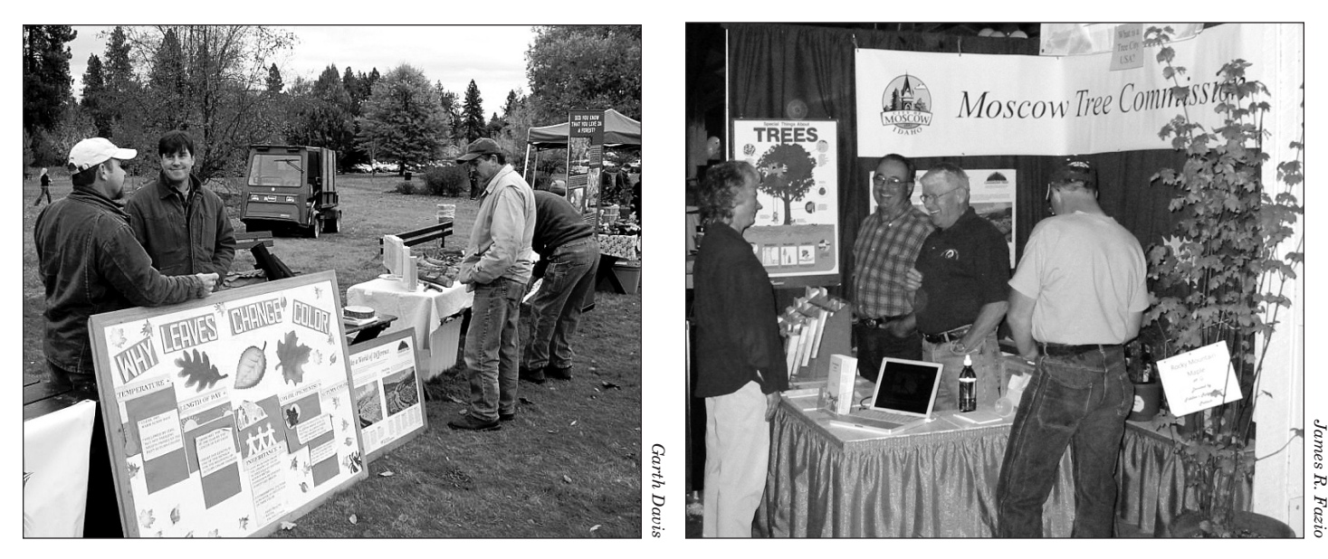
Educational displays benefit the community and can keep board members active throughout the year planning and serving as exhibit staff. In Spokane, Washington (left), the Urban Forestry Tree Committee and Urban Forestry Citizen's Advisory Committee are joined by over a dozen other organizations at the Fall Leaf Festival in Finch Arboretum. The Moscow, Idaho Tree Commission (right) displays at the county fair and the summer/fall farmer's market. A popular feature at the fair is a raffle for several potted trees that are also on display.

It is a rare tree board that does not want to educate residents about the benefits and care of trees. One way to do this is to sponsor booths at community events. The key to a good display is having something large and eye-catching and then providing something of value. The 'give-away' may be literature about trees (See page 8), free trees, tickets for a drawing, or promotional products like sun visors, fans, tote bags and other useful items.