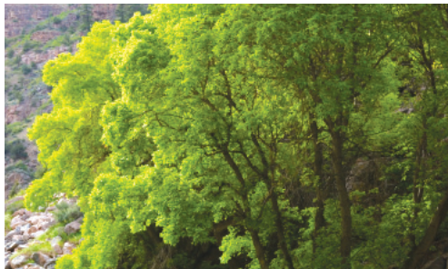
Wyoming's state tree is the Cottonwood.