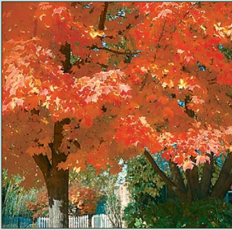
West Virginia's state tree is the Sugar Maple.