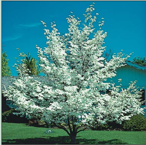
Virginia's state tree is the Flowering Dogwood.