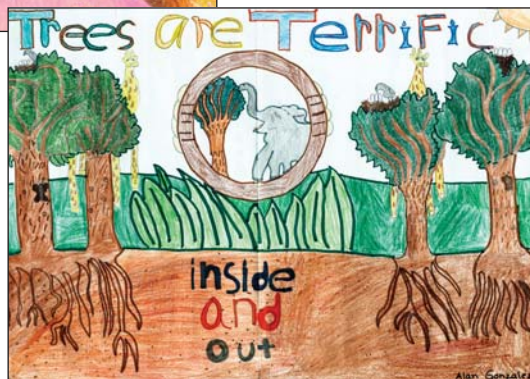
(Right) 2008 Virginia State Winner