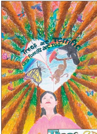
(Above) 2007 Virginia State Winner

Each year, the Arbor Day Foundation coordinates the Arbor Day National Poster Contest, sponsored by Toyota, for fifth graders in classrooms across the country. Now in its seventeenth year, the contest reaches millions of children with its message about the importance of trees and wise environmental stewardship.