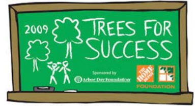
National Tree Planting Campaign • 2009

D uring the last four years, more than 4,000 trees have been planted across the country at schools and local parks because of the Trees for Success program. Trees for Success is a national program, sponsored by The Home Depot