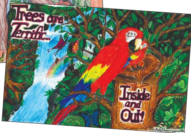
(Below) 2008 Texas State Winner