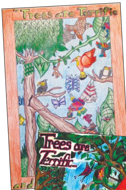
(Left) 2007 Texas State Winner