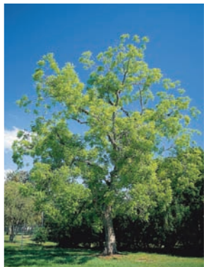
Texas's state tree is the Pecan.