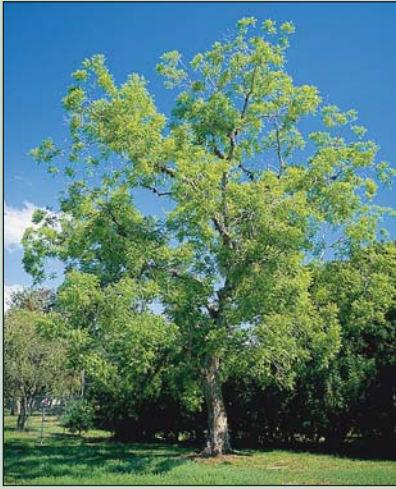
Texas's state tree is the Pecan.