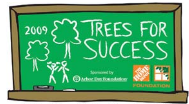
National Tree Planting Campaign • 2009

D uring the last four years, more than 4,000 trees have been planted across the country at schools and local parks because of the Trees for Success program. Trees for Success is a national program, sponsored by The Home Depot Foundation, that demonstrates the many educational