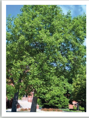
Tennessee's state tree is the Tulip Poplar.