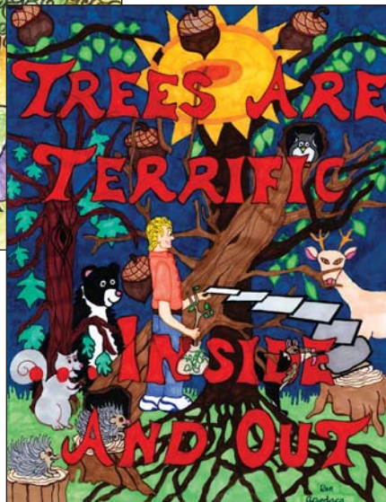
(Right) 2008 Tennessee State Winner