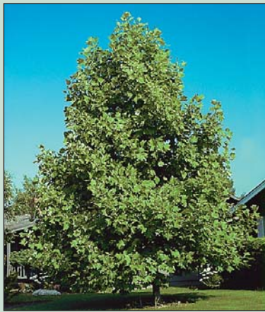
Tennessee's state tree is the Tulip Poplar.