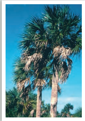
South Carolina's state tree is the Cabbage Palmetto.