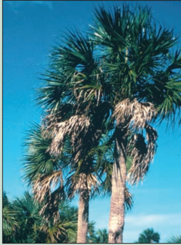
South Carolina's state tree is the Cabbage Palmetto.