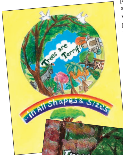
(Left) 2006 2nd Place National Winner

Thousand of fifth-graders were encouraged by this educational program to think deeply about how trees make the world a greener, healthier place. By conveying their interpretation of the theme in their artwork, the student's message that trees are terrific is spread to thousands of people around the country.