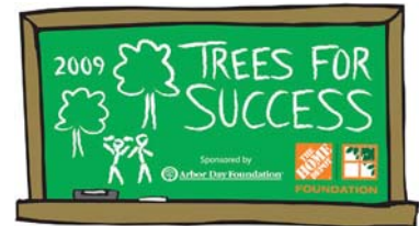
National Tree Planting Campaign • 2009

D uring the last four years, more than 4,000 trees have been planted across the country at schools and local parks because of the Trees for Success program. Trees for Success is a national program, sponsored by The Home Depot