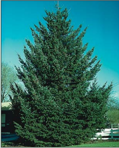
Oregon's state tree is the Douglasfir.