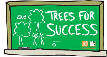
National Tree Planting Tour • 2008

The Arbor Day Foundation will collaborate with local Albuquerque-based nonprofit tree-planting organizations to plant 100 large trees on school grounds in the Albuquerque area during the "Trees for Success" national campaign. Schoolchildren in the Albuquerque area will be invited to take part in the tree-planting event and other fun and educational activities, giving them an opportunity to interact with nature and take an active role in improving their own community. Albuquerque's celebration is an outstanding example of the Arbor Day Foundation's work with local nonprofit groups and important corporate partners to advance community forestry across the nation. Visit treesforsuccess.org for more information on the "Trees for Success" national campaign.