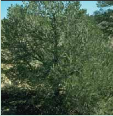
New Mexico's State Tree is the Pinon.