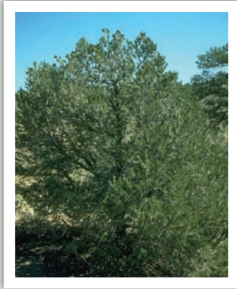
New Mexico's state tree is the Pinon.