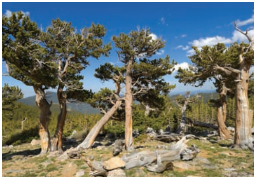
Nevada's state trees are the Singleleaf Pinyon and Bristlecone Pine (pictured).