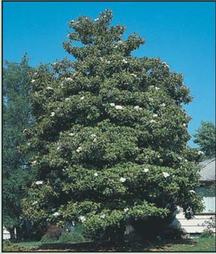
Mississippi's state tree is the Southern Magnolia.

Active Arbor Day Foundation members in Mississippi 9,806