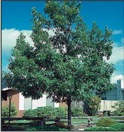
Minnesota's state tree is the Red Pine.