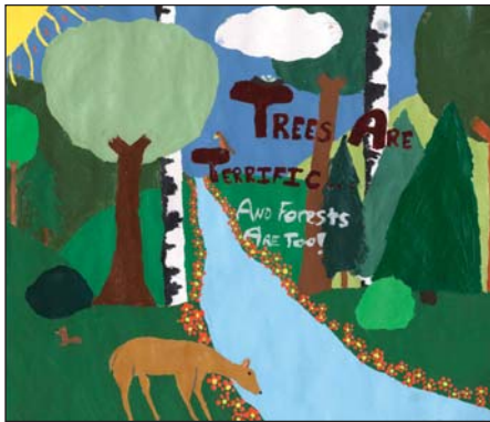
2007 Minnesota State Winner

During the 2008 contest more than 37,500 Minnesota fifth-grade students had the opportunity to learn the importance of tree diversity in a community forest. Tonya L. was named the state contest winner. Her winning poster depicted several parts of a tree illustrating the contest's 2008 theme, "Trees Are Terrific . . . Inside and Out!"