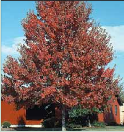
Iowa's state tree is the Oak.