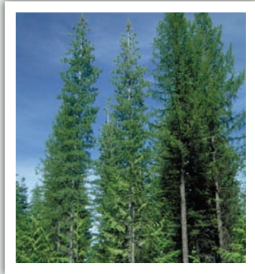
Idaho's state tree is the Western White Pine.