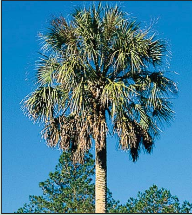
Florida's state tree is the Sable Palm