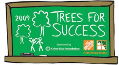
National Tree Planting Campaign • 2009

D uring the last four years, more than 4,000 trees have been planted across the country at schools and local parks because of the Trees for Success program. Trees for Success is a national program, sponsored by The Home Depot Foundation, that demonstrates the many educational and environmental benefits trees provide to improve the health of our communities. Schoolchildren in 13 cities across the country will have an opportunity to add new trees to their school grounds or neighborhoods where they live and play.