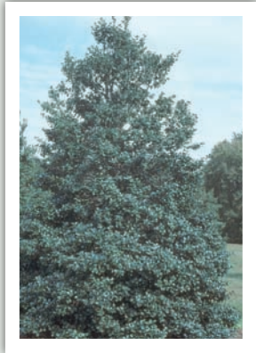
Delaware's state tree is the American Holly.