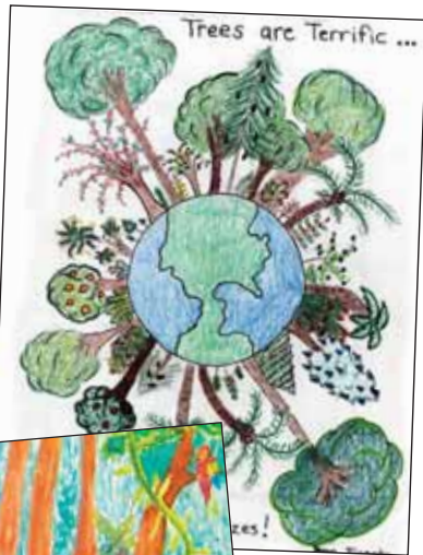
(Above Right) 2006 Delaware State Winner