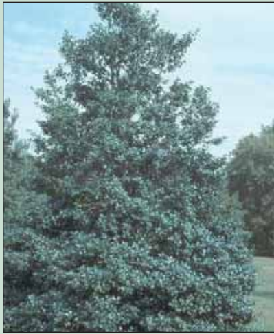
Delaware's state tree is the American Holly.