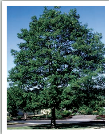
Connecticut's state tree is the White Oak.