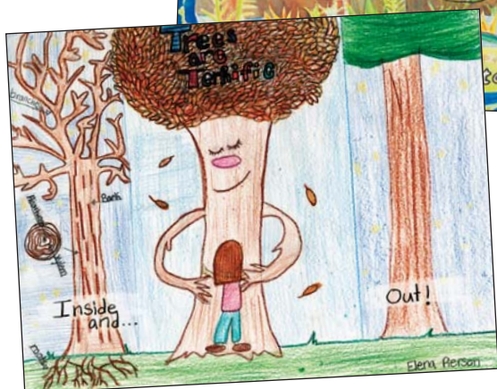
(Left) 2008 Arizona State Winner