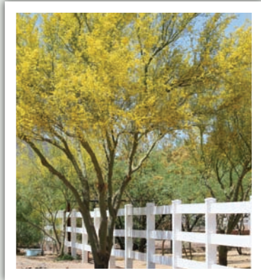
Arizona's State Tree is the Paloverde.