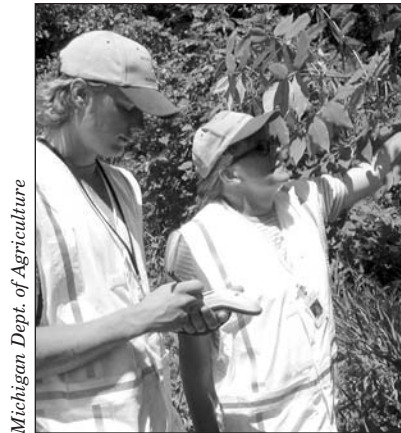
Michigan Dept. of Agriculture

Minnesota has a long history of citizen monitoring. The state's Certified Tree Inspector Program began in 1974 primarily to document the spread of Dutch elm disease and oak wilt. Today, this program is supplemented with Forest Pest First Detectors for the early discovery of infected trees. In this program, volunteers prepare to monitor a variety of tree pests by completing three online training modules and then an all-day workshop. Individuals learn how to identify targeted pests such as the emerald ash borer, properly collect samples and report any findings to the Minnesota Department of Agriculture. They also are expected to help with public education campaigns. In addition, the Department of Agriculture maintains an "Arrest the Pest" hotline to help with quick response after the sighting of invasive pests in a new area.