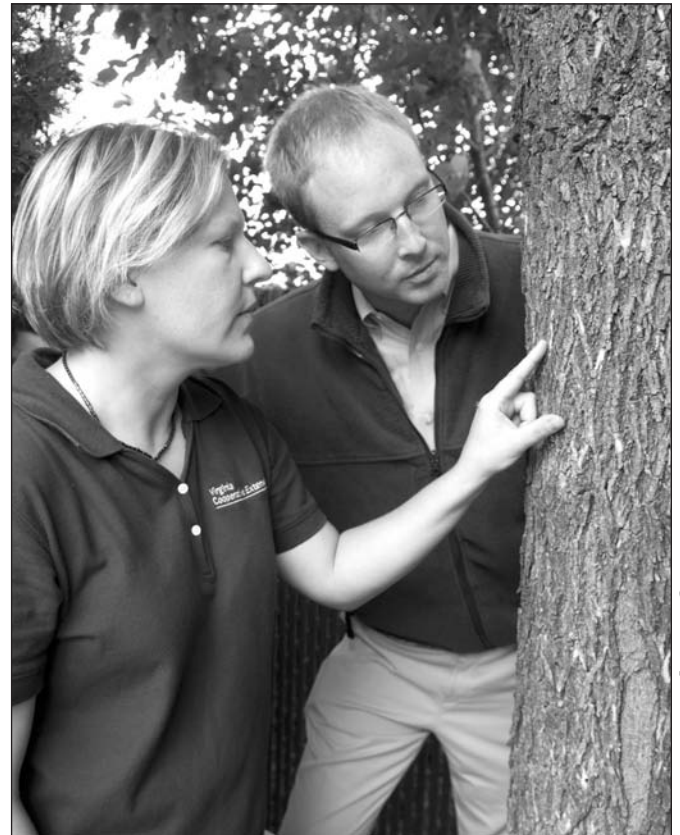
Virginia Cooperative Extension

In the best of American tradition, we are rising to the challenge. Scientists, forest managers and urban foresters are working overtime to control current invasions. But they need help. This bulletin is intended to expand the important function of citizen monitoring. Through this early alert system, it is possible to slow or even stop the spread of invasive pests.