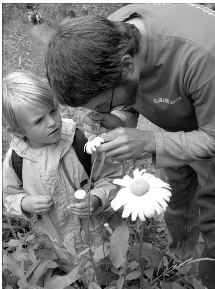
UAF Cooperative Extension Service

Even without the current enhancements, Alaska's Integrated Pest Management Program has been exemplary in using early detection, identification and education in the fight against invasives since 1981. In fact, in 2003 IPM staff identified the western tent caterpillar that sneaked into the state on ornamental tree stock. Thanks to early detection, the insect was eradicated before it spread.