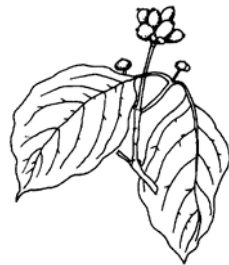
White Flowering Dogwood