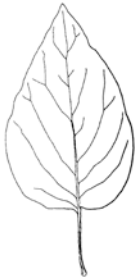
Pekin Tree Lilac