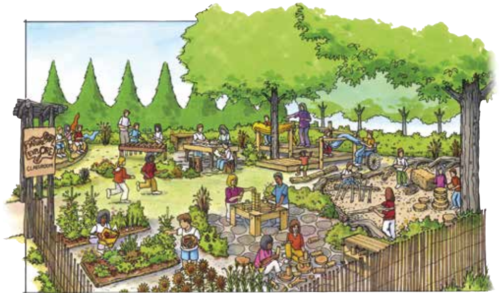
Each Nature Explore Classroom is uniquely designed for its space and users.